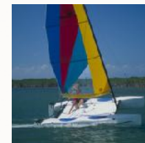
Raise hull on a Fast Hobie Wave "Easy to Sail"