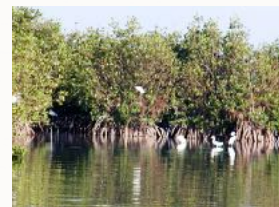
Search for the unique wildlife on Florida Bay

$325 plus a free observer pass to Dolphins Plus.