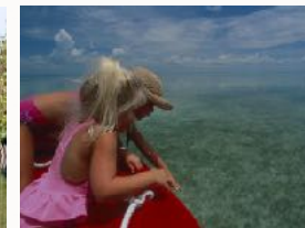
The Amazing Florida Bay's Backcountry is endless!