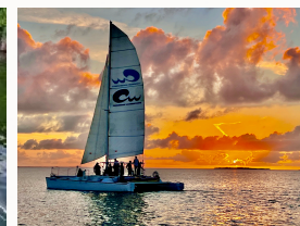
Champagne Sunset Cruise Perfect way to end the day!