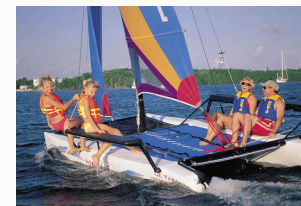
Learn to Sail the Hobie Way. Book your Lesson today!