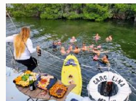
A Mimosa Cruise is a perfect way to start the day!

Public Charters $80++Ad, $65 Ch <13 min of 8, max of 24